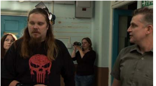
Being shown around Crowley Hall