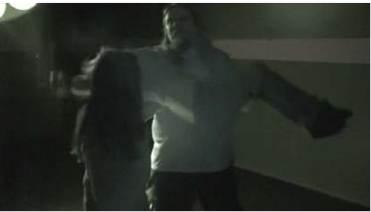
Problems at Crowley Hall