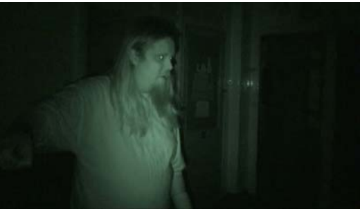
Night vision Vigils