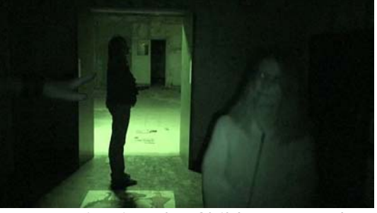
Investigating the Children's Ward